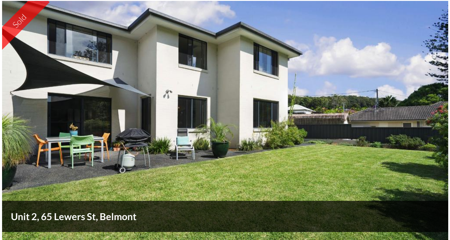
Unit 2, 65 Lewers St, Belmont